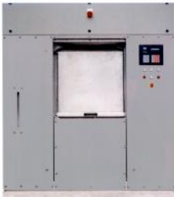
Drive and oscillation system